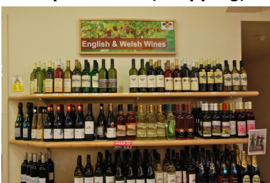
Local wine at Ludlow Food Centre