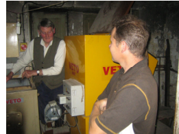
A visitor has the working of the wood chip boiler explained at Acton Scott Hall