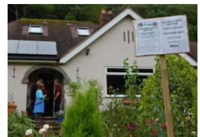
Low Carbon Homes Day