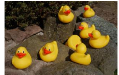
Ready for the Duck Race