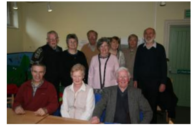
Our volunteers in training