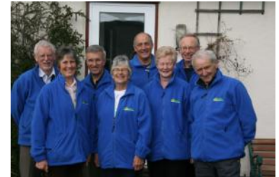
Our volunteers at Penwardine