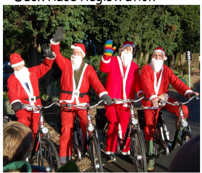
Electric Bike launch