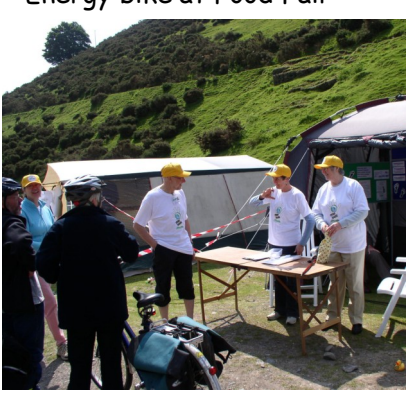
Duck Race Registration