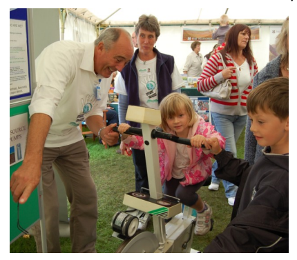
Energy bike at Food Fair