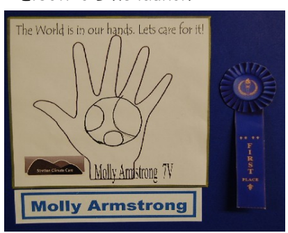
Tee shirt logo competition at Church Stretton School