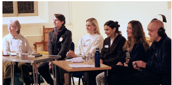
Q & A session after the AGM "Giving Young People a Voice"