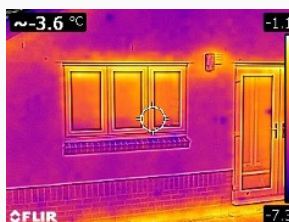
Showing heat loss round top of windows and below damp course as the floor of this property is uninsulated.

We will also be offering our free Thermal Imaging survey which gives an easily understood pictorial image of where the property is leaking valuable heat.