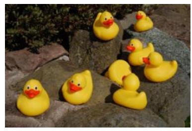
Ready for the Duck Race